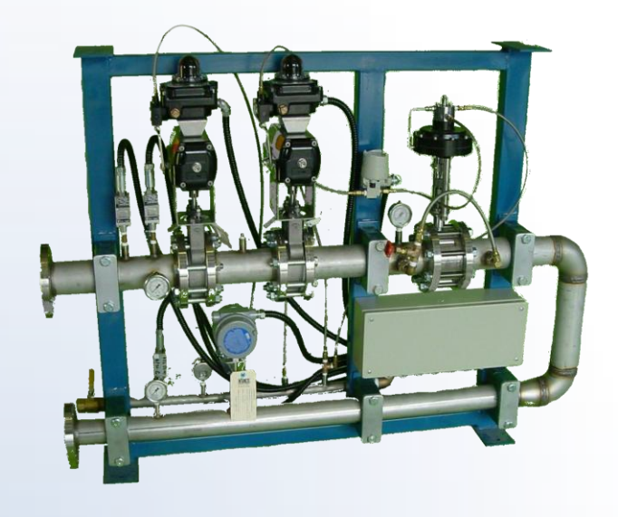
OXYGEN FLOW CONTROL & SAFETY SHUT-OFF W/INTEGRATED PLC/IO DROP