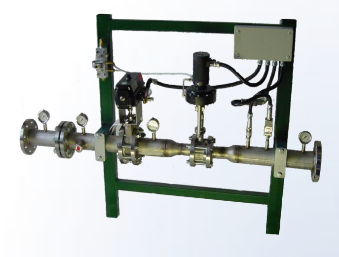
ELECTRONIC PRESSURE REGULATION FOR OXYGEN SUPPLY W/HIGH FLOW TURN-DOWN & LARGE DIFFERENTIAL PRESSURE CONTROL

Xothermic, Inc. custom designs and fabricates a variety of process control skids ranging in function from safety shut-off to pressure control. Each of these skids was custom designed for a specific installation requirement.