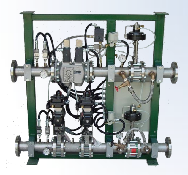
NATURAL GAS/OXYGEN FLOW CONTROL & SAFETY SHUT-OFF W/LOCAL SHUT-OFF W/ INTEGRATED PLC/IO DROP