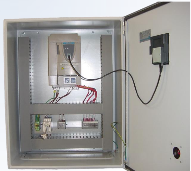
10 HP ELECTRICAL ENCLOSURE FOR VFD/BLOWER